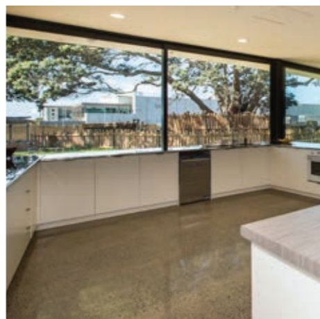
ABOVE LEFT Eurostackers easily provide a 6m opening. ABOVE RIGHT Large bench to ceiling windows seamlessly frame the outdoor view. RIGHT A connection between the indoors and outdoors is key to the success of this open learning environment.