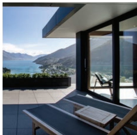
ABOVE LEFT Eurostackers open out to a private deck. ABOVE RIGHT Large robust full height Eurostackers meet at a corner pillar and maximise the stunning lake and mountain views. RIGHT An abundance of glass including clerestory windows allows light to flood in.